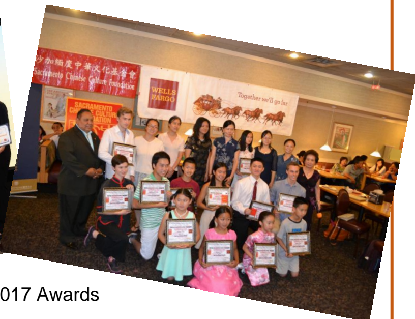
2016 & 2017 Awards