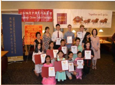
SCCF awarded over $15000 scholarships in 2016 to local schools teaching Chinese language and culture.