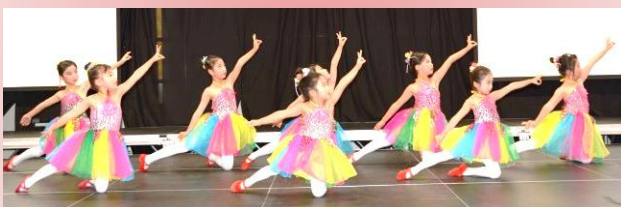
Community Chinese School Performance