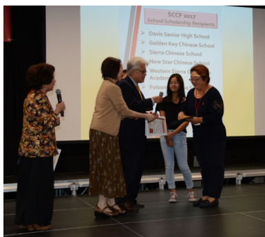
Scholarship Award Ceremony