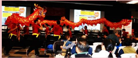
Lions & Dragon Dance from Western Sierra Collegiate Academy