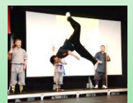
Shaolin Temple Kung Fu Zen Academy Performance