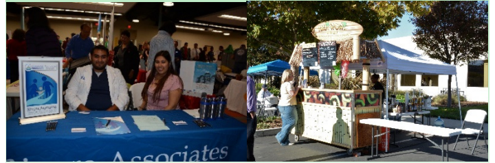
Active Participation of local vendors and non-profit organizations