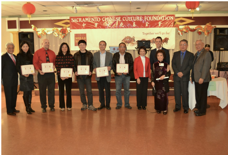
Chinese Schools Won the Wells Fargo School Grant